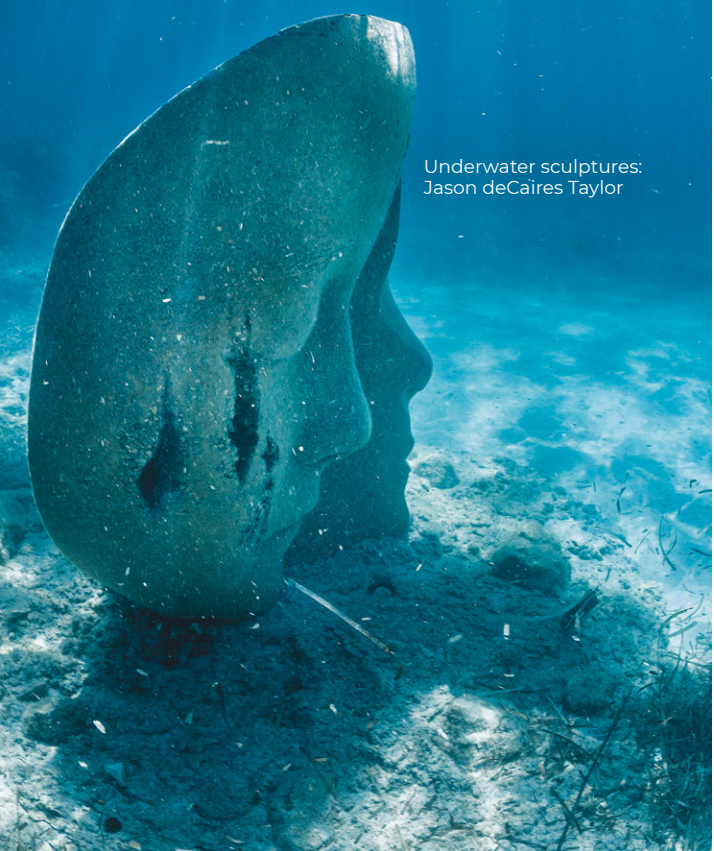
Underwater sculptures: Jason deCaires Taylor

Most divers wearing a mask and snorkel can visit the sculptures. The sculptures will evolve over time and be covered in seaweed, shellfish and benthic fauna to become an integral part of the local ecosystem .