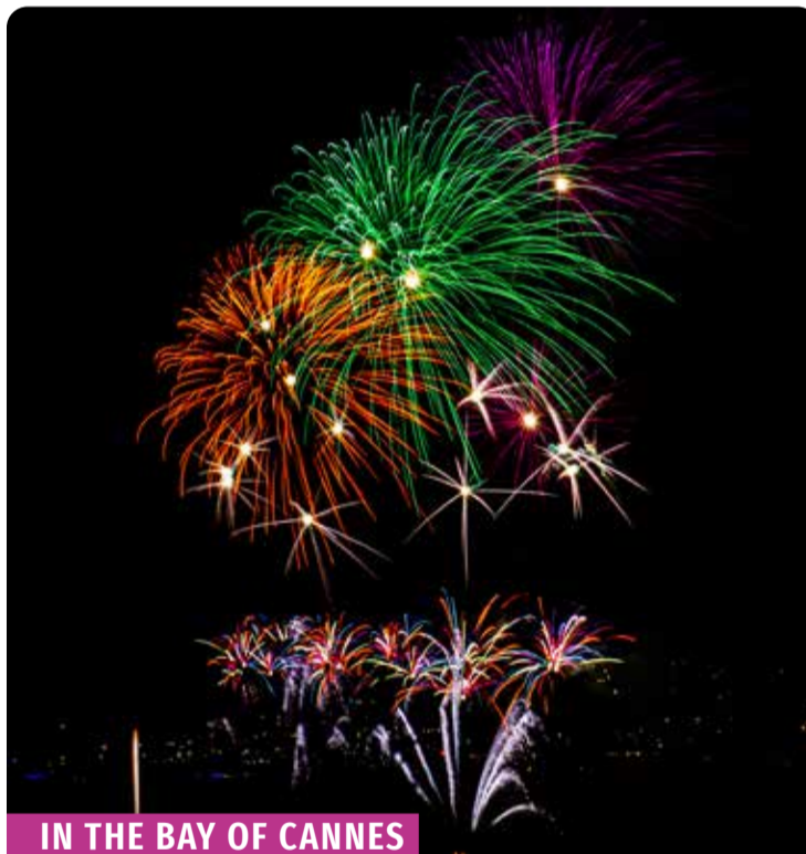
IN THE BAY OF CANNES