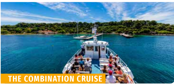
THE COMBINATION CRUISE